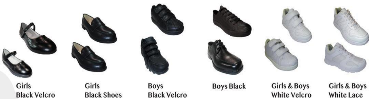
Girls Black Velcro